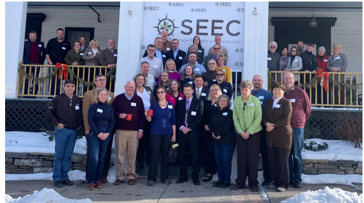
SEEC PROSPERITY FORUM: LODGING POSSIBILITIES, JANUARY 2020